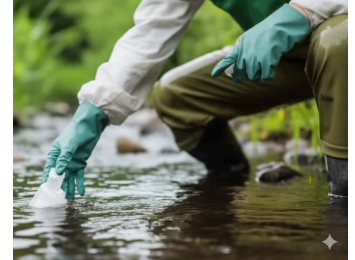
Ground Water / Surface Water

Water analysis is a critical process to ensure safety, quality, and regulatory compliance across industrial, commercial, and domestic applications. At Cali-Labs Pvt.Ltd. we conduct comprehensive physical, chemical, and microbiological testing using advanced instrumentation and standardized methodologies. Our analysis covers key parameters such as pH, turbidity, total dissolved solids (TDS), heavy metals, microbial contamination, and other critical indicators as per national and international standards including BIS and FSSAI guidelines. With a commitment to accuracy, reliability, and timely reporting, we help businesses maintain product integrity, meet statutory requirements, and safeguard public health through precise and dependable water quality assessment.