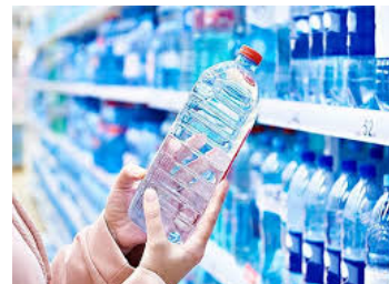
Packaged Drinking Water