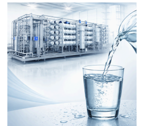
RO Water/Drinking water

Comprehensive chemical and microbiological analysis to ensure water safety, regulatory compliance, and suitability for food processing and consumption.