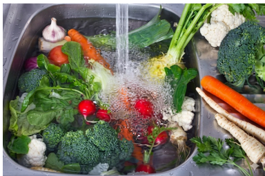
Water for food processing