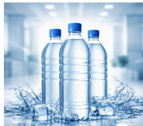
Packaged Natural Mineral Water